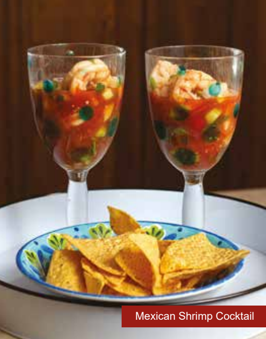
Mexican Shrimp Cocktail

4. Cool in the pan on a rack, and then use the parchment paper to lift out the brownies before slicing. (Use a plastic knife for cutting.)