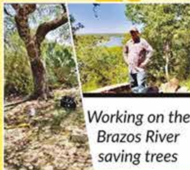
Working on the Brazos River saving trees