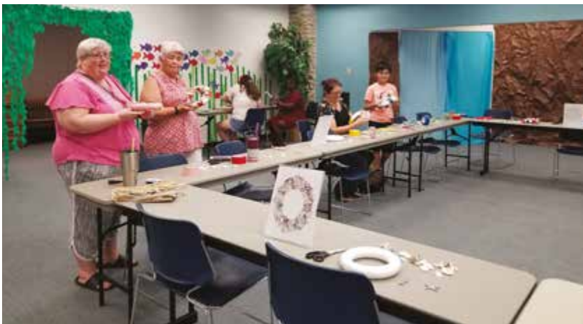
Weatherford Library patrons enjoy a craft evening making nautical wreaths.