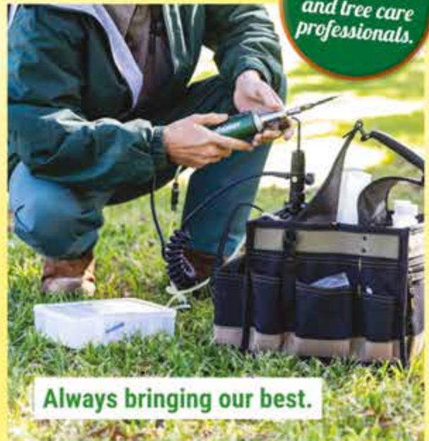
Always bringing our best.