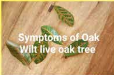
Symptoms of Oak Wilt live oak tree