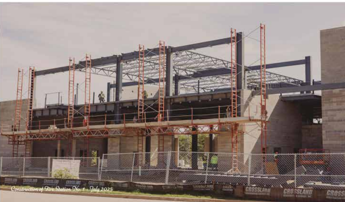
Construction of Fire Station No. 1 - July 2025