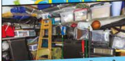
Crowded and Messy Garage?