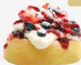
Very Berry Signature Roll

FREE HOT OR ICED COFFEE WITH PURCHASE OF A SIGNATURE ROLL!