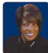
Sandra Lee Tarrant County Constable PCT 7