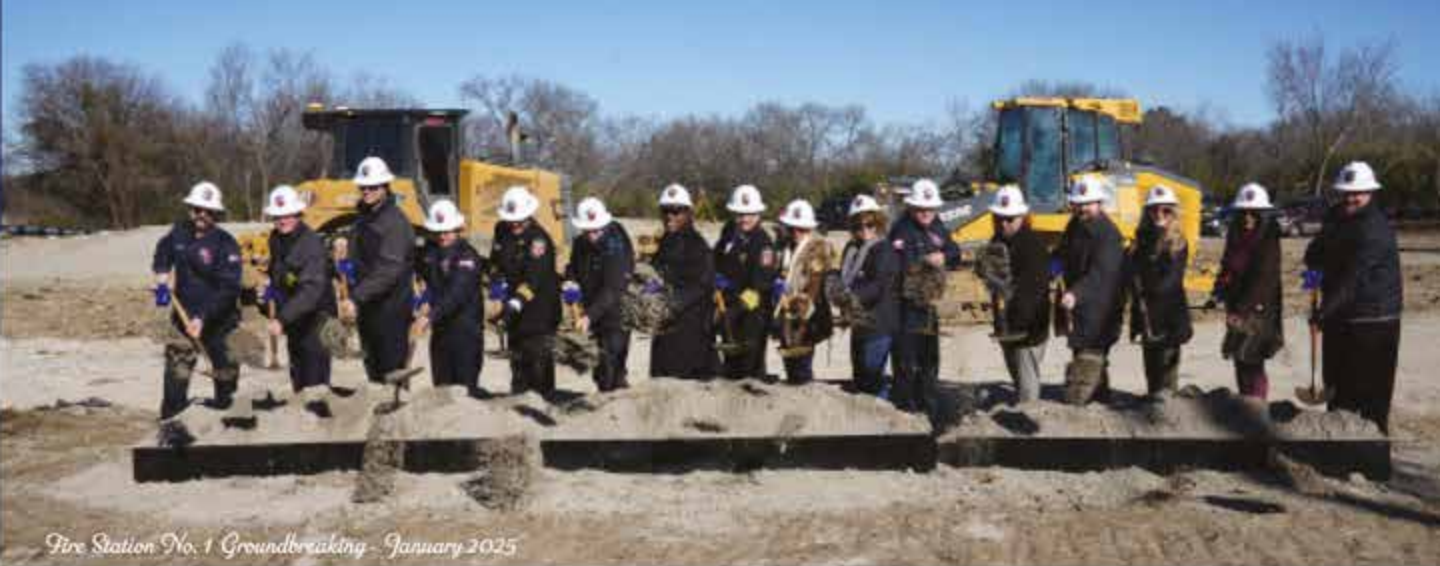
Fire Station No. 1 Groundbreaking - January 2025