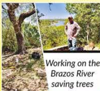
Working on the Brazos River saving trees