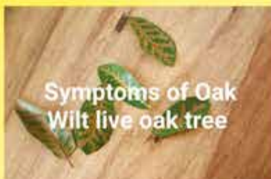
Symptoms of Oak Wilt live oak tree