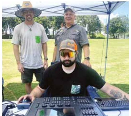
The audio, video and sound crew from Showtech prepares for Boomin' 4th in Hudson Oaks.