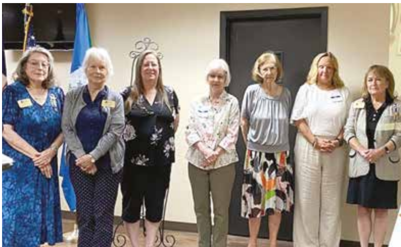
The Weatherford Chapter of Daughters of the American Revolution installs new officers for 2024–2026.