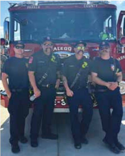
Local firefighters give truck tours and safety tips to attendees at Go West Community Showcase.