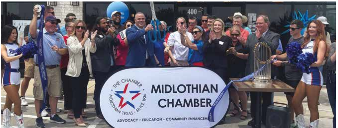
Blue Mint Thai & Asian Cuisine “cuts the ribbon” with the Chamber at its new Midlothian location!