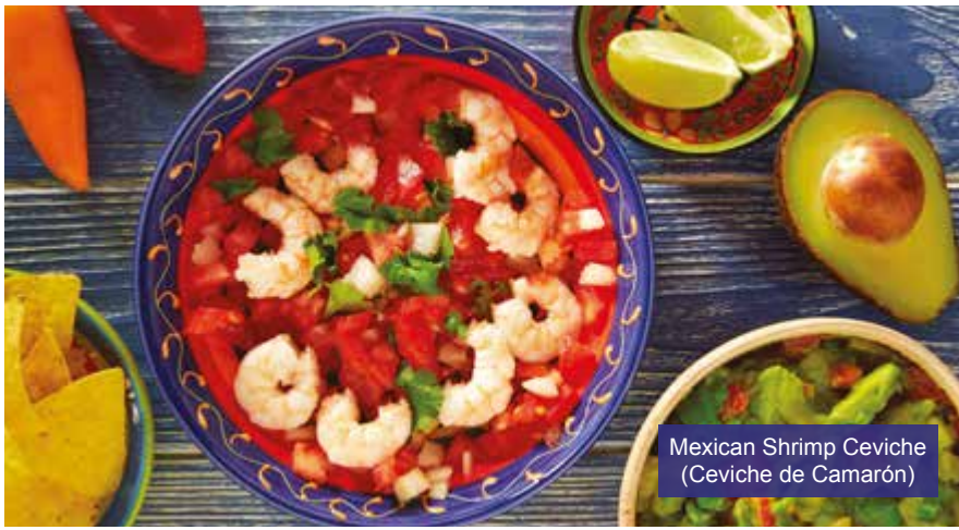
Mexican Shrimp Ceviche (Ceviche de Camarón)