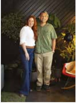
The Millers step back in time with their home design.