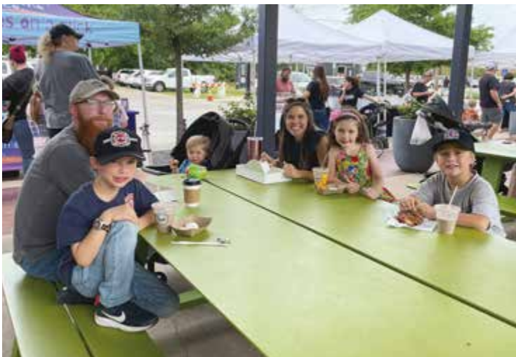
The Sanderson family tries some local flavors.