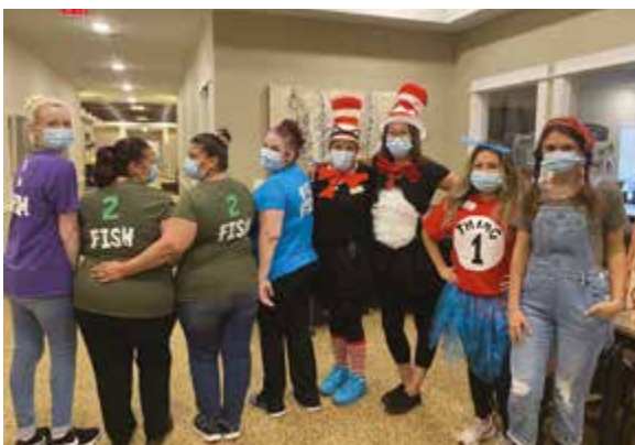
The Clear Fork Assisted Living and Memory Care staff dresses in favorite story book character costumes as part of themed Fridays.