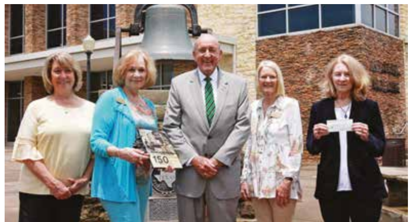
Parker County Women’s and Newcomers’ Club donates to the WC Foundation.