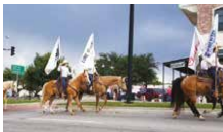
Parker County kicks off the annual PCSP Rodeo and Frontier days with a parade.