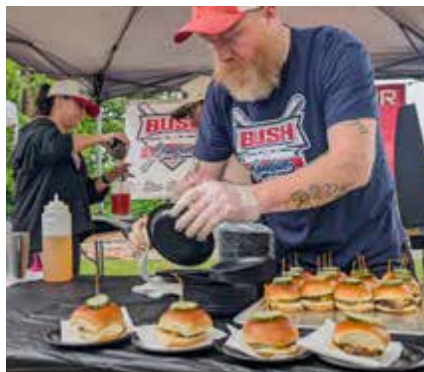
Bush League Bar & Grill wins Best Entrée at the Weatherford College Foundation's annual Taste of Parker County.