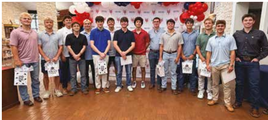
The Class of 2026 wraps up their final year with Young Men's Service League-Aledo at a banquet at Doss Heritage and Culture Center.