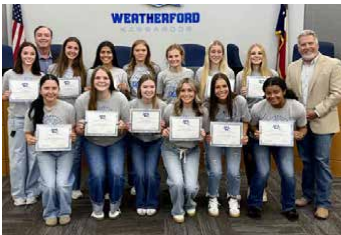
The Weatherford High School Lady Roo Soccer Team is recognized for earning District 3-6A All-District honors and a bi-district championship at a recent board meeting.