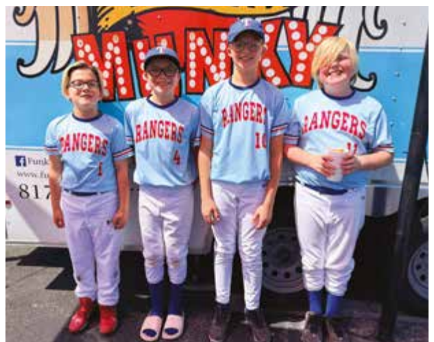
The Rangers celebrate with snowcones at The Funky Munky after a baseball win at Aledo Athletics Inc.