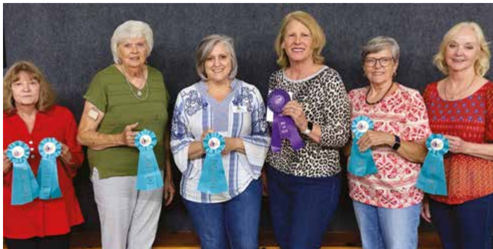
Local artists receive Awards of Merit for their pieces at the 2026 Weatherford Art Association Members Show.