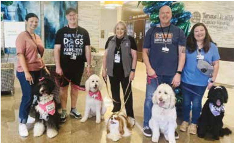
Therapy dogs and their humans celebrate Employee Appreciation Day at Texas Health Huguley.