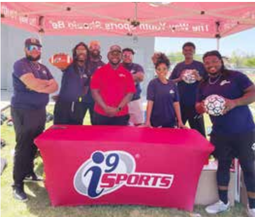
The i9 Sports crew kicks off the sports season with a day of play for Burleson youth at Hughes Middle School.