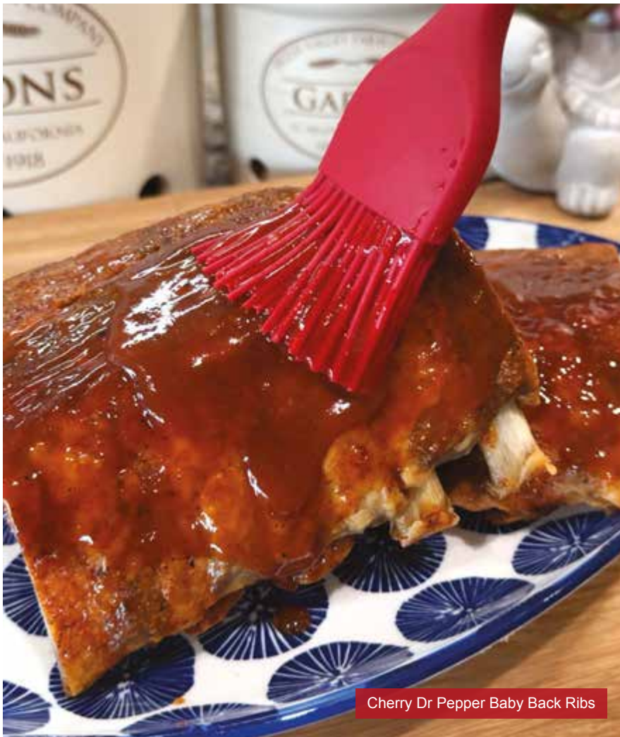
Cherry Dr Pepper Baby Back Ribs