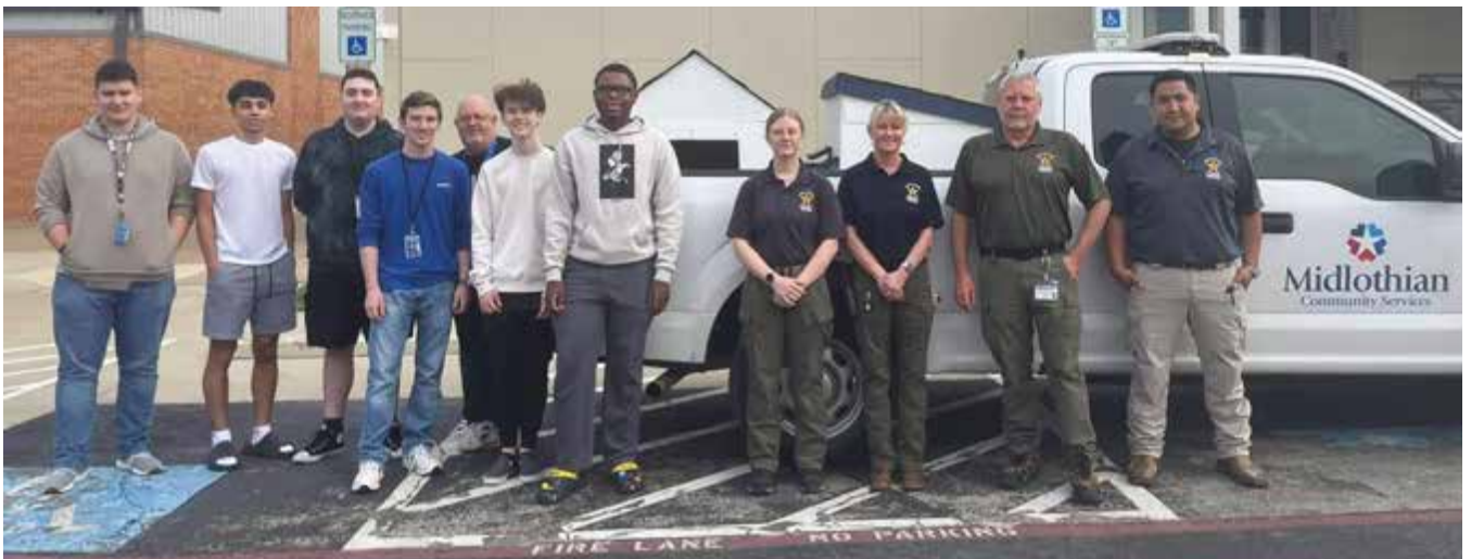
MISD Civil Engineering students deliver dog houses, which were built as their service project this year, to the animal shelter.