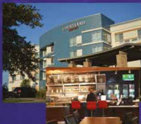
Courtyard by Marriott opened in 2016. Breakfast, dinner and cocktails are offered in its Bistro.