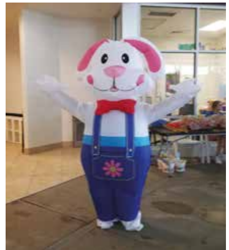
A lovable bunny welcomes spring and Easter.