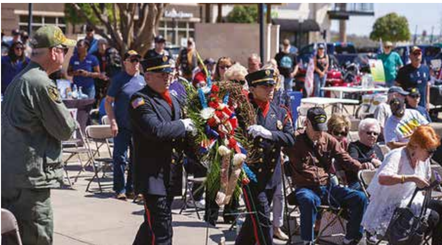
The city of Burleson honors Vietnam veterans.