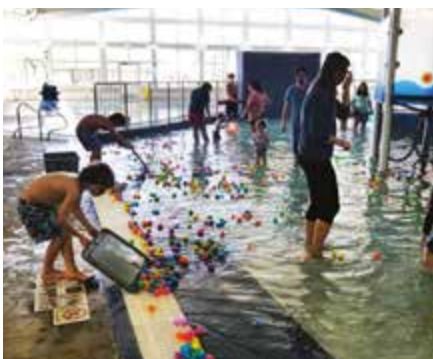
The annual aqua egg hunt at the BRiCk attracts many from the community.