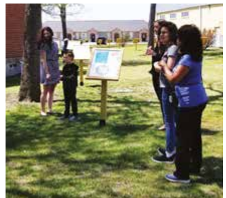
Library fans welcome the new storyboard walk behind the library.