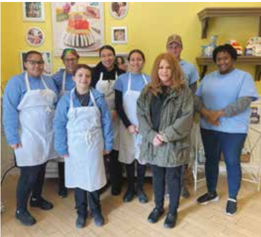
The Nothing Bundt Cakes team bakes treats for their community.