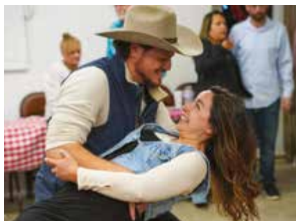
Burleson couples celebrate Valentine's Day at Russell Farm's Date Night Experience.