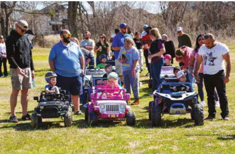
Young drivers rev their engines at Burleson’s Off-Road Rally.