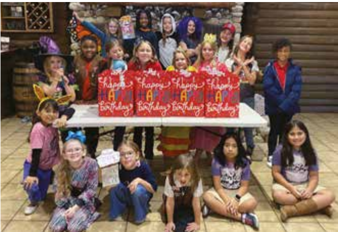
Girl Scout Troop No. 338 uses cookie proceeds to coordinate birthday boxes for North Ellis County Outreach’s delivery to local youth in need.