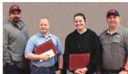
The City of Red Oak recognizes its 2023 Employee of the Year nominees.