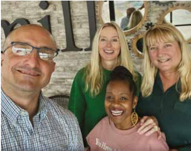
One of the owners of The Mill assists customers by taking a selfie.