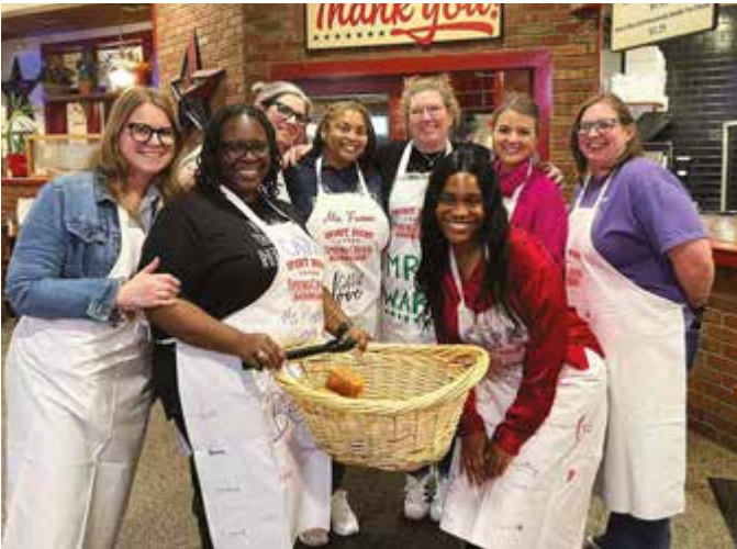
Charlotte Anderson Preparatory Academy educators volunteer on Spirit Night at Spring Creek Barbeque.