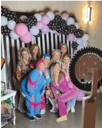
Friends pose while taking a fun picture.