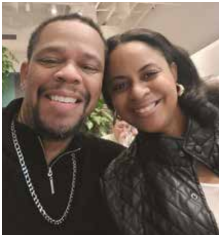
The Glovers enjoy dinner at their daughter's birthday celebration.