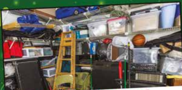
Crowded and Messy Garage?