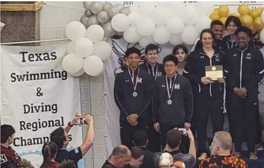
Mansfield and Lake Ridge swimmers head to the State Meet.