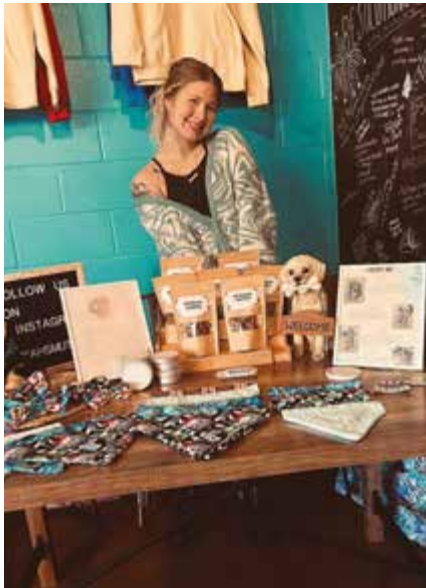
Mykah's Mutts conducts a popup shop at the Squirrel Coffee Company.