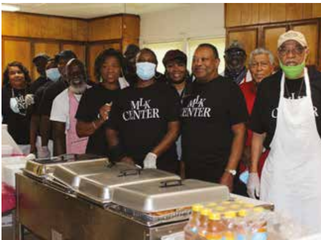
The eating and fellowship is always great at MLK Community Center's breakfast celebrations.