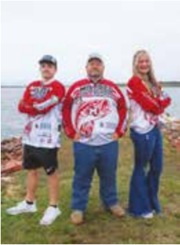
The “catch” isn’t all these members gain while fishing.