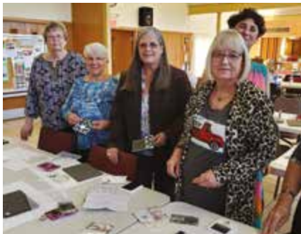
These ladies have a good time at Corsicana Senior Center's weekly card-making class.