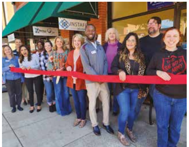
It's ribbon-cutting time at Instaff's new location.