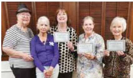
Better Garden Club members celebrate the group's annual recognitions by the District X State Garden Club.