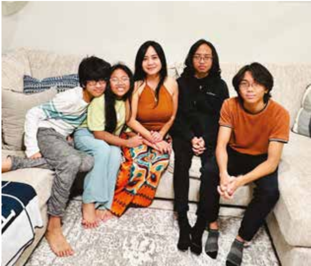
The Adil family spends time together.