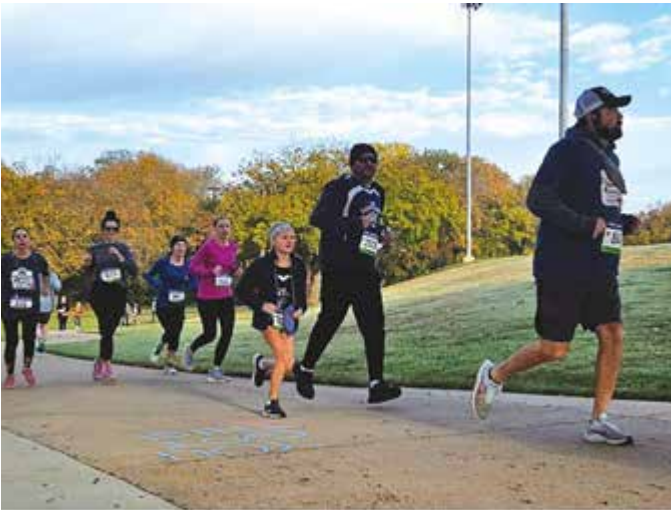
Many participate in the 10th anniversary of the Kiwanis Club of Mansfield’s FaLaLaLa 5K!