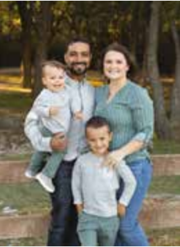
The Dietrichs allow the community into their world of serving.