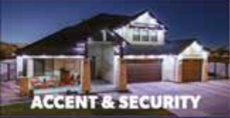
ACCENT & SECURITY