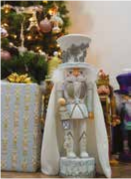
The holidays feature nutcrackers and new traditions for one Weatherford family.