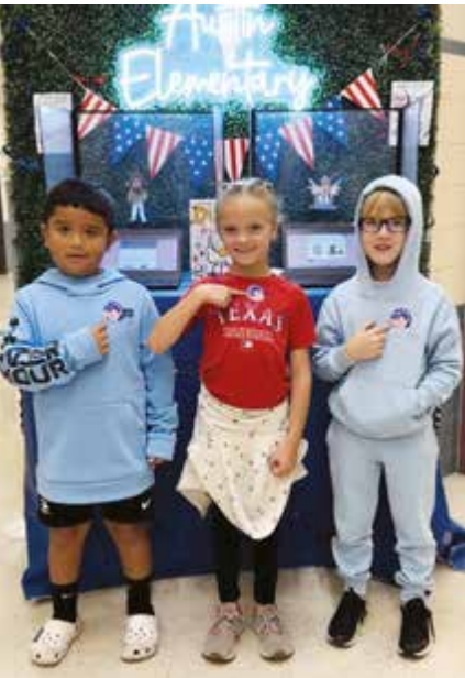
Austin Elementary students cast their ballots for Duck or Farmer Brown for president while learning about the election process.