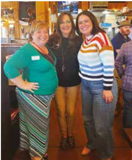
Local businesses gather at the Parker County Chamber of Commerce’s recent event, Sip & Socialize After Dark, which was sponsored by Baker’s Ribs.