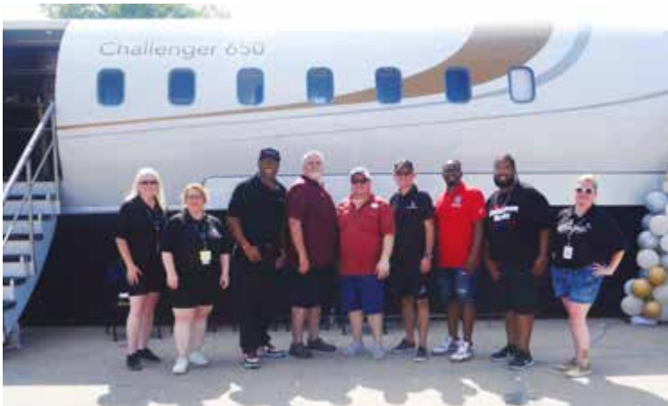
Bombardier, presenting sponsor for the Red Oak Area Chamber of Commerce Founders Day Festival, provided its Challenger 650 fuselage for event goers to tour.