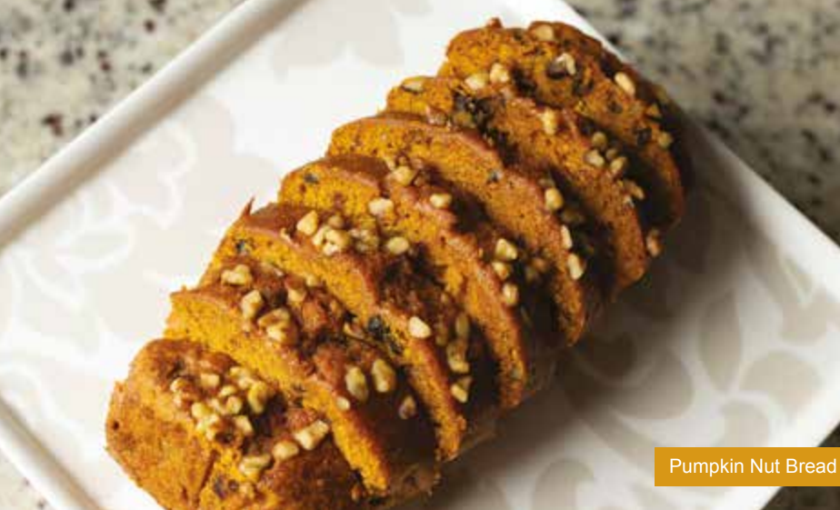
Pumpkin Nut Bread

combined. Add the flour, rolled oats and chocolate chips. 5. Bake for 10 minutes. 6. Transfer to a wire cooking rack; let cool for 15 minutes. 7. Serve and enjoy with a glass of milk!