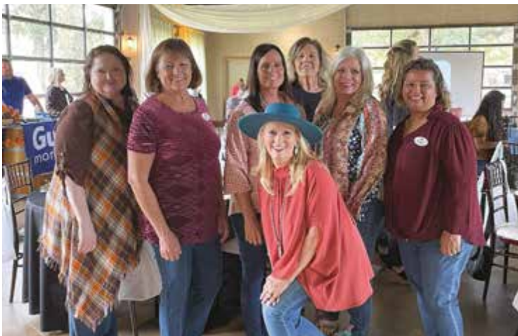
The team at Stewart Title of Burleson, along with their sponsors, throw a charcuterie board building party for their clients.