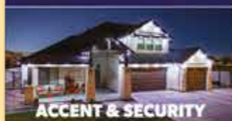
ACCENT & SECURITY