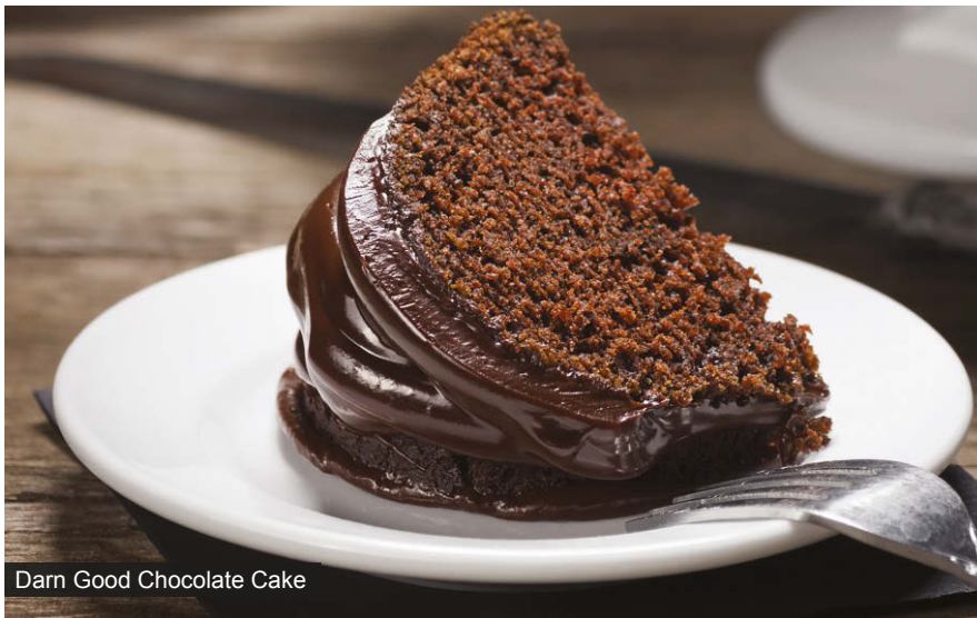
Darn Good Chocolate Cake