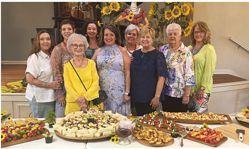
Kinsloe House Bloom & Belong Social Committee members kick off another great year at KH.