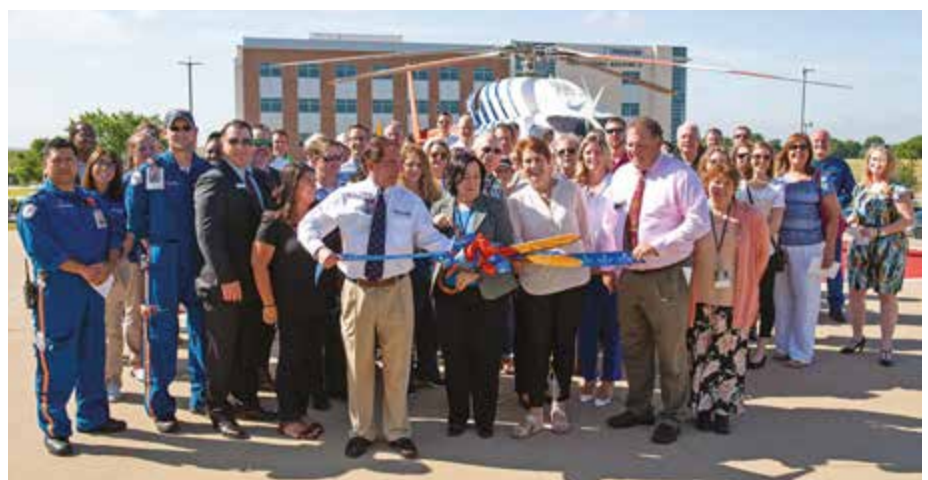
The community comes together on the Methodist Mansfield helipad to officially celebrate the opening of the Amon G. Carter Foundation Kids Zone and CareFlite.