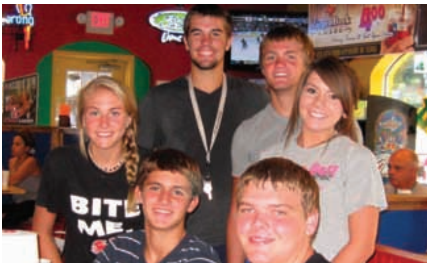
The North Side Baptist Church youth group hangs out at Fuzzy's Tacos.