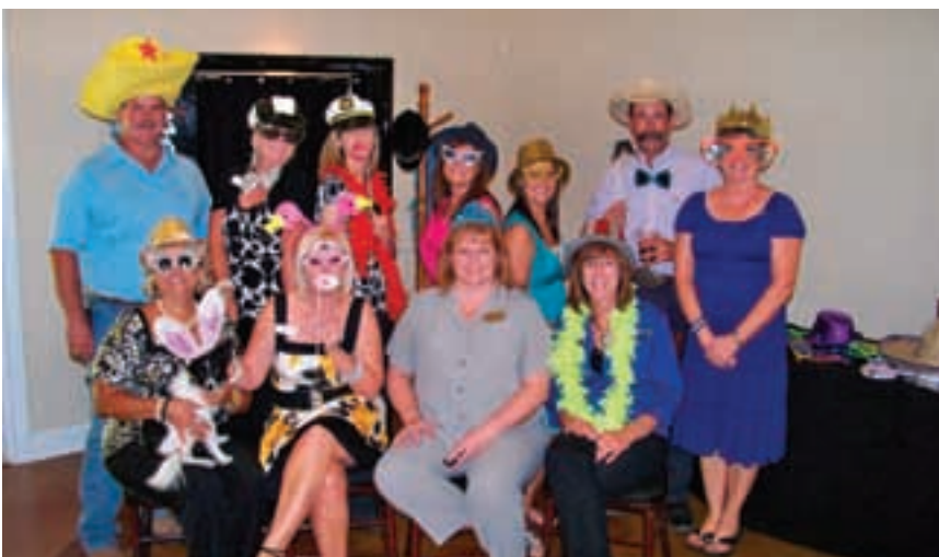
Whoever said ribbon cuttings were boring should come join the fun bunch at the Weatherford Chamber.